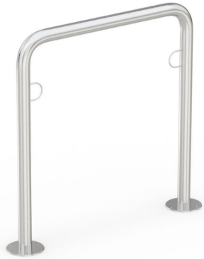
Bike Rack Economy R30 – Floor mounting